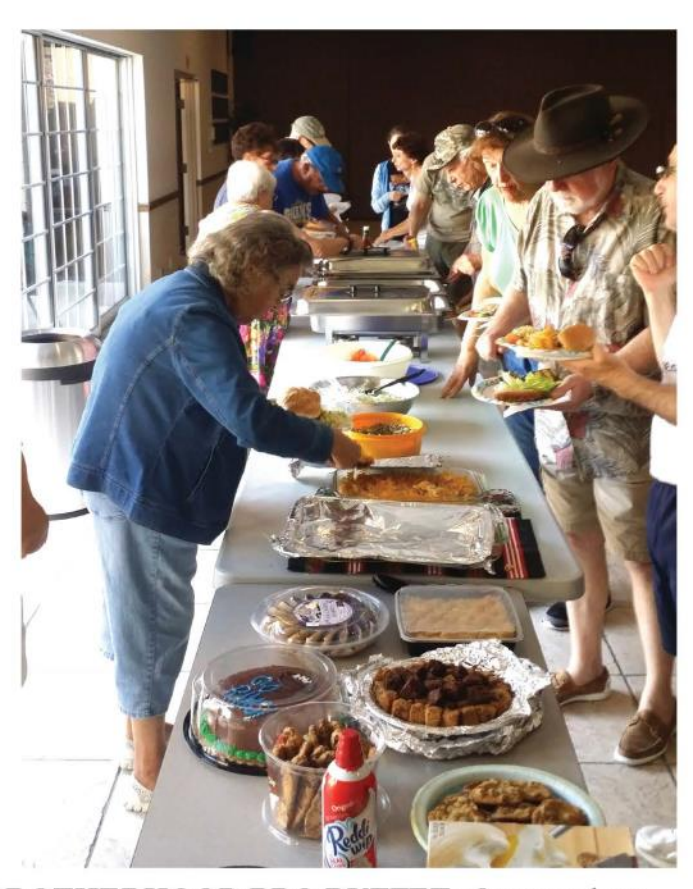
BROTHERHOOD BBQ BUFFET: Our members heading in line to eat a delicious set of everything from burgers and hot dogs to side dishes and desserts, along with a diversity of drinks, made them very focused on their appetites.