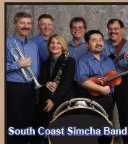
South Coast Simcha Band