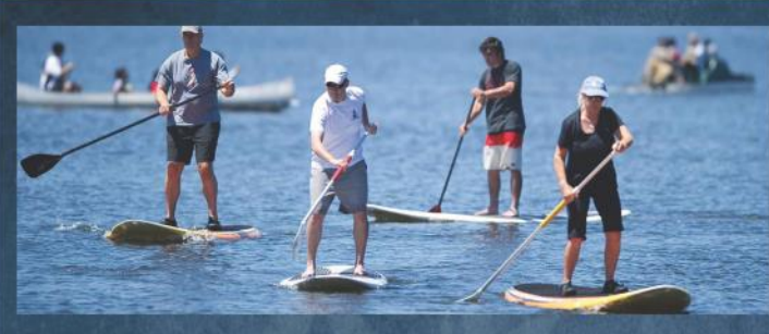
KAYAK/STAND UP PADDLE BOARD

Choose ONE of the two activities and make Seven Stops Celebrating the Holiness of Shabbat