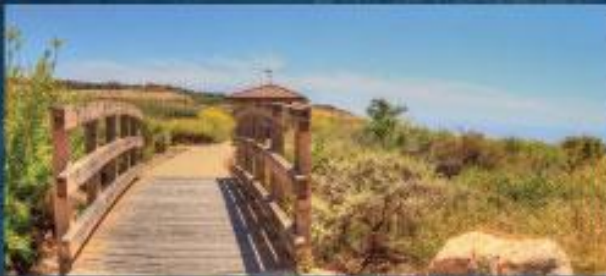
WALK IN EL DORADO PARK

Choose ONE of the two activities and make Seven Stops Celebrating the Holiness of Shabbat