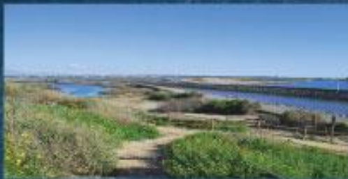
Walk at Bolsa Chica Reserve

Choose ONE of the two activities and make Seven Stops Celebrating the Holiness of Shabbat