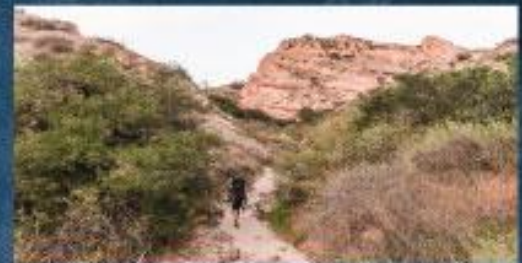
Hike at Whiting Ranch

Meet off of PCH across from the state beach