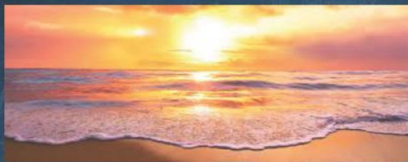
WALKING IN SAND @ SEAL BEACH

Bring your own slices of challah and Kiddush if desired