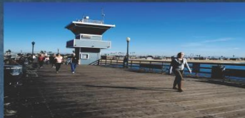
WALKING ON SIDEWALK @ SEAL BEACH