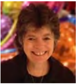
1965 Beth David Choir